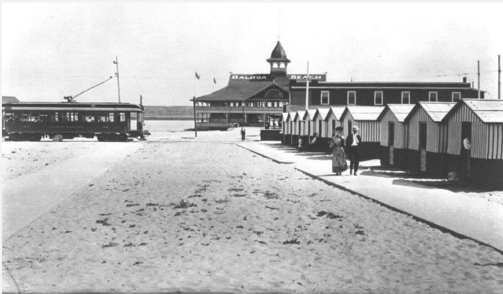
Exhibit 1. Pacific Electric’s Red Car Line taking visitors to the Balboa Pavilion, 1910.