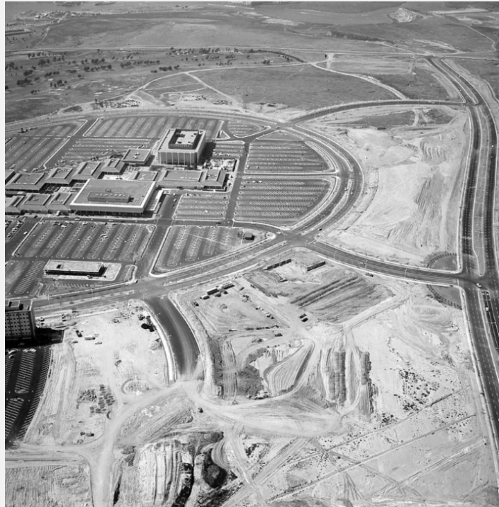
Exhibit 2. Construction of Fashion Island, 1967.